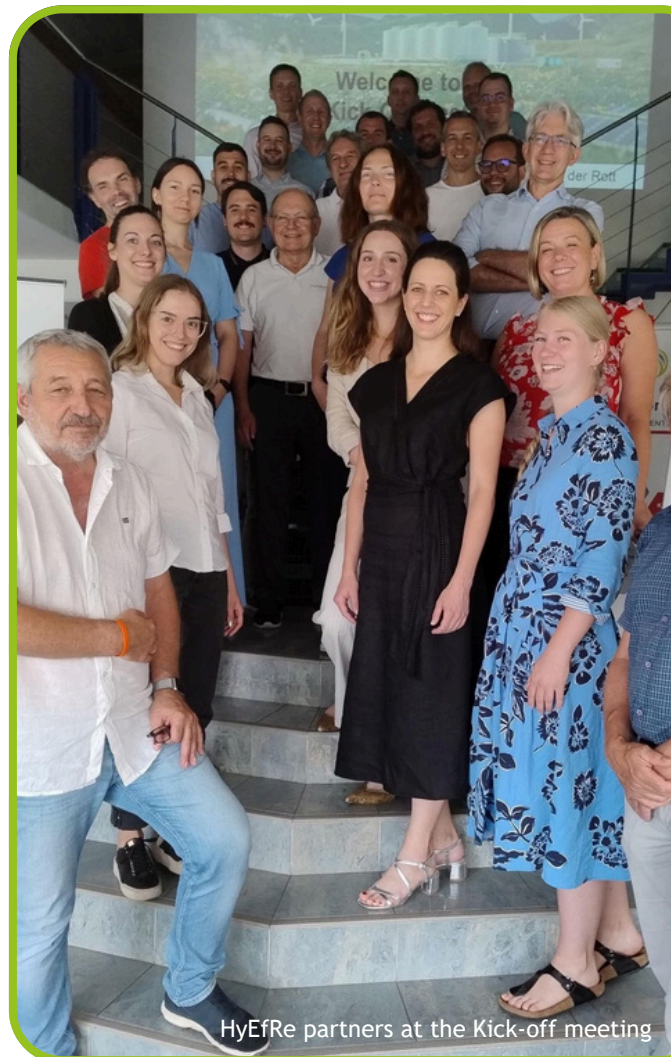
HyEfRe partners at the Kick-off meeting

The project partners will evaluate hydrogen potentials with new models and develop and test a new tool to calculate ideal parameters for technical plants. The project’s action plan for policy actors aims to reduce the regulatory barriers impeding a timely expansion of renewables and green hydrogen