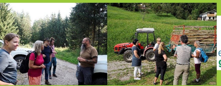
Integration of Stakeholders & Scientific Experts